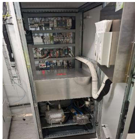
Slika br. 3 - Izgled unutrašnjosti jednog Tecora DECS ormana