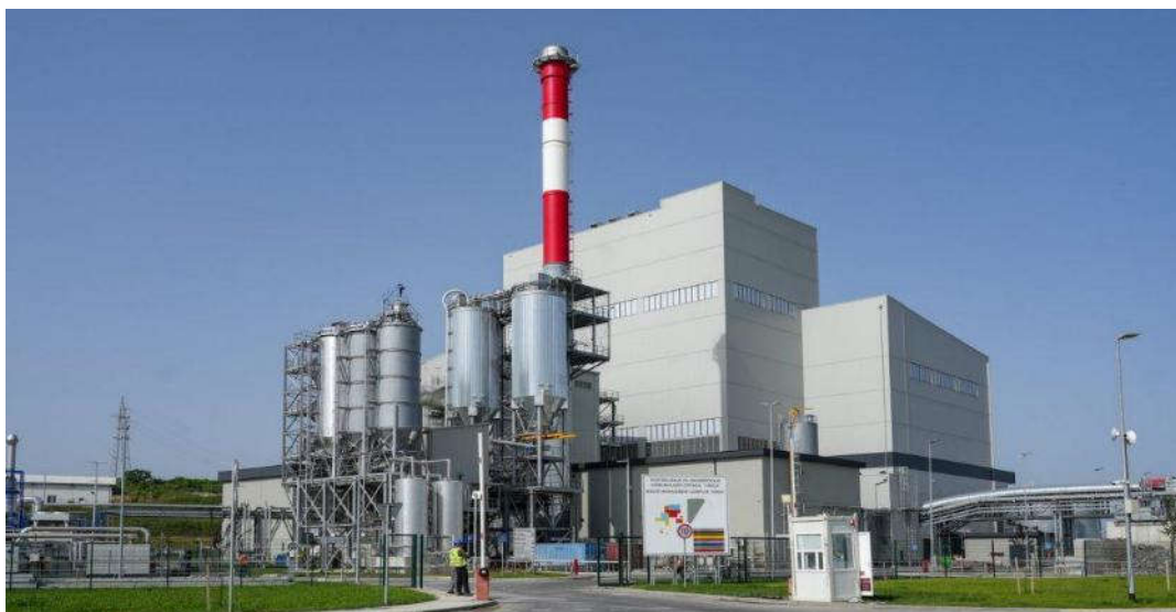
Slika br. 1