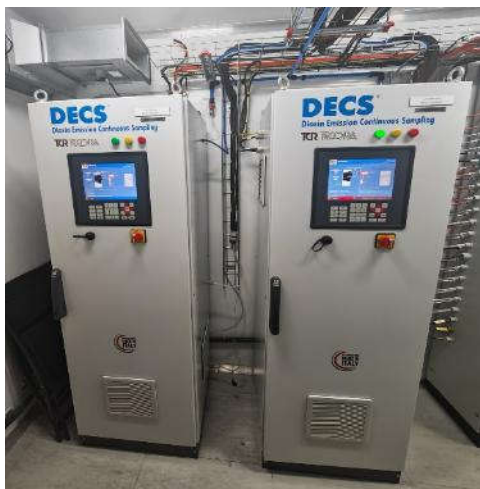
Slika br. 2 - Tecora DECS orman